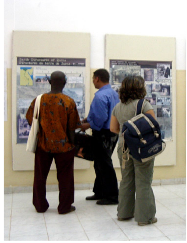
A Qurnawi antiquities inspector, a conference delegate (centre), was fascinated to learn about his village.

Qurna History Project is the bringing together of different strands of historical work that have grown over the last sixteen years. Qurna Discovery is one part of the project.